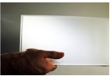
Lighting Mockup - Daytime