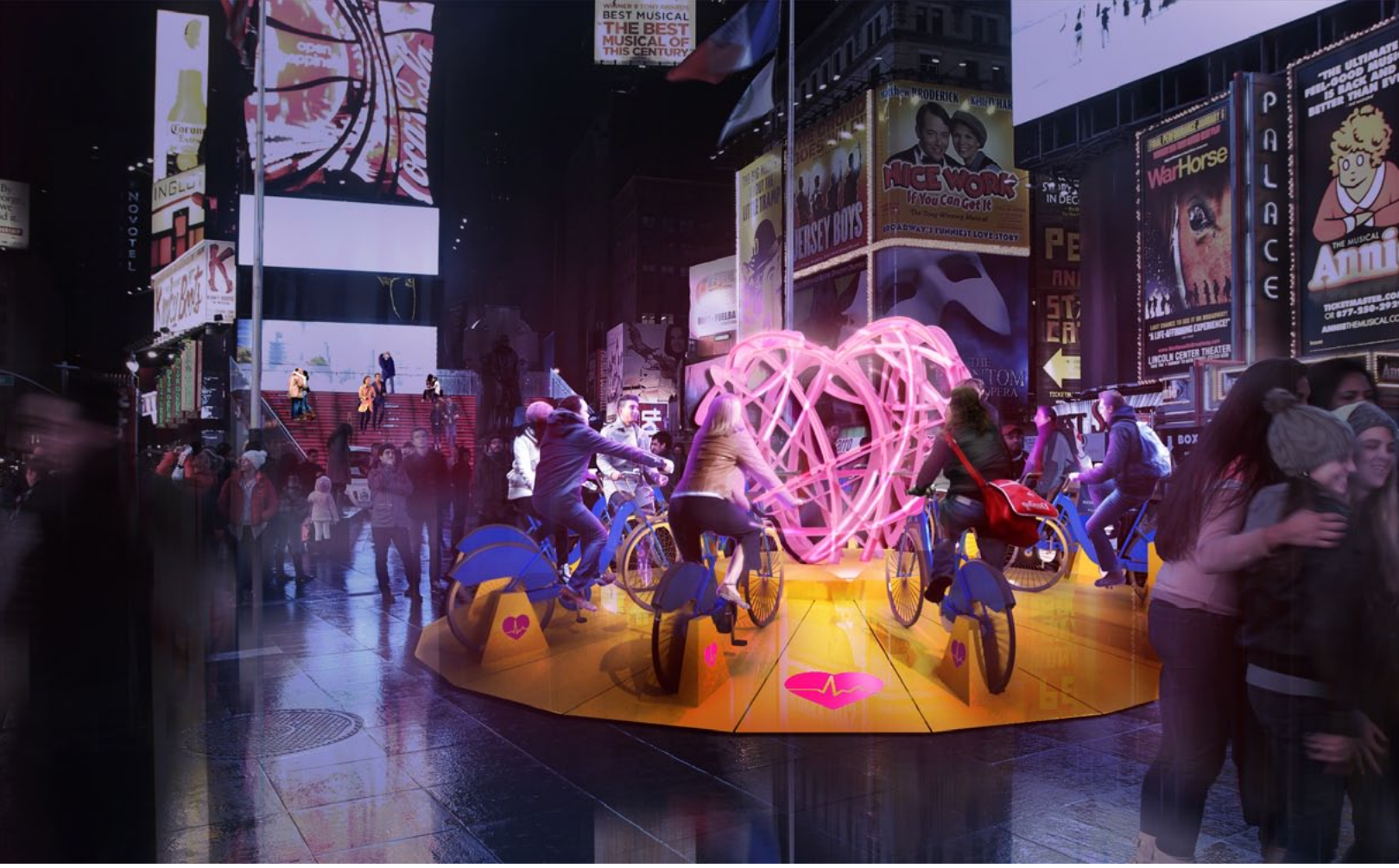
Rendering - Nighttime