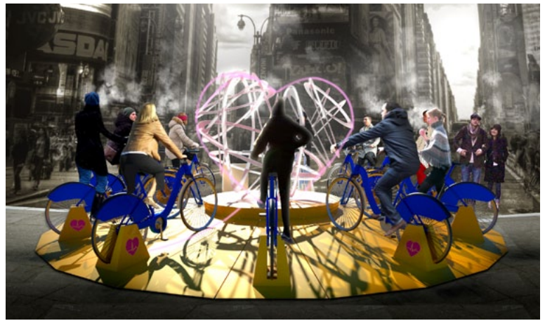
Rendering - Daytime

Love that comes from the heart; Love that is good for the heart; Love that warms you from the inside... Literally. Together we can create something beautiful. Happy Valentine!